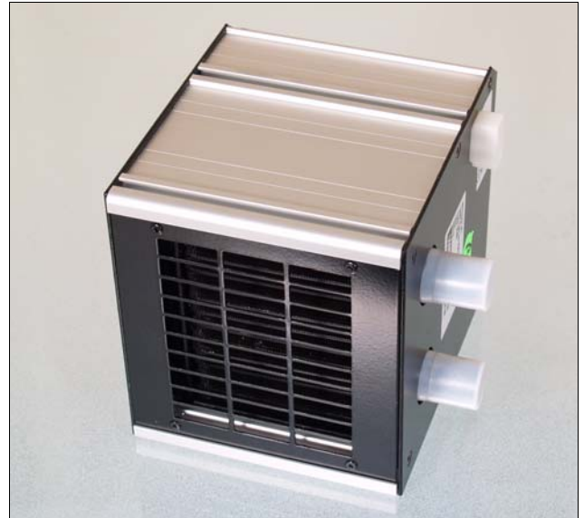
Figure: Whisper 3C

In one simple operation, the heating core can be turned from left to right side and vice versa. You simply unscrew the side plate, removing the heating core, turning it and mounting it back again.